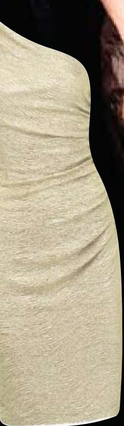
▶ GLITTERING BUSTIER DRESS £350 Vera Mont