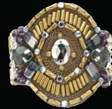
◀ QUEEN NATASHA CUFF Accessorise £18

My Style Companion provides stylists and personal shoppers for women who want a cost-effective, versatile and practical wardrobe. It also runs personal stylist courses in Manchester. Visit mystylecompanion.com to find out more.