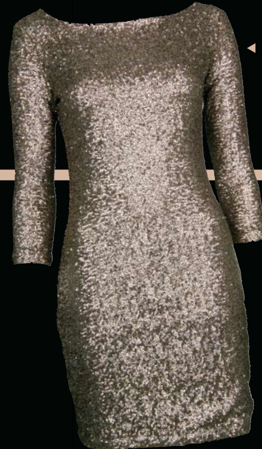
▶ DARK GOLD SEQUIN DRESS £40 desireclothing.co.uk