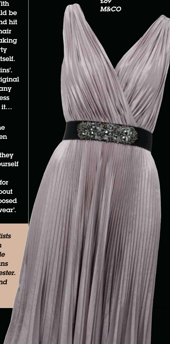
▶ METALLIC PLEATED DRESS £69 M&CO