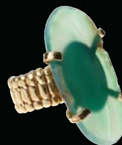
▶ GREEN AGATE STONE RING £18 bagsofsparkle.com