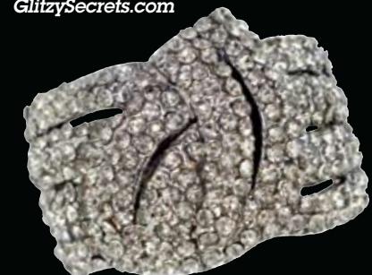
▶ TREASURED HEIRESS COCKTAIL RING £23 GlitzSecrets.com