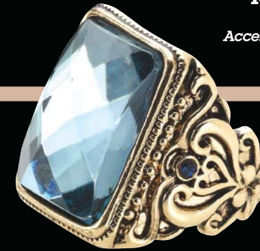
▶ EVIE COCKTAIL RING £6 Accessorize