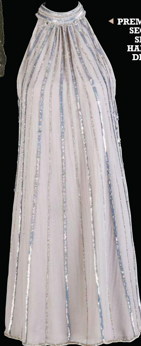
▶ PREMIUM SEQUIN SPRAY HALTER DRESS. £75 Oii